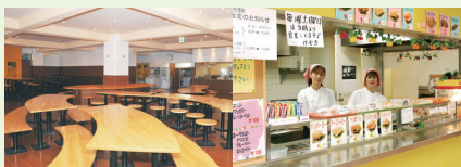
Restaurant / Cafeteria