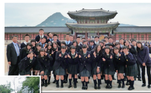
Republic of Korea