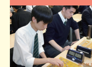
Go & Shogi